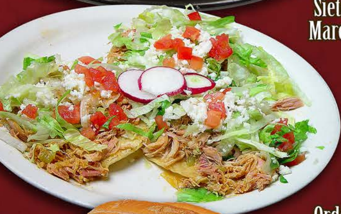
Orden de Sopitos