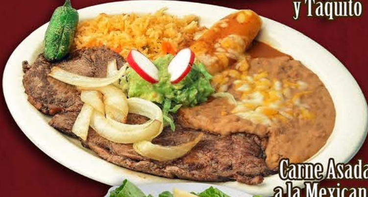
Carne Asada a la Mexicana