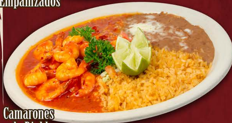
Camarones a la Diabla