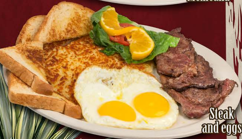
Steak and eggs