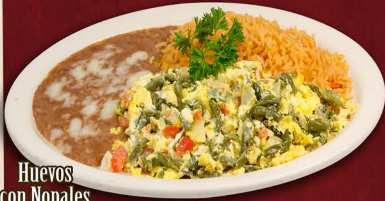
Huevos con Nopales

Pictures in this menu are for illustrative purposes only