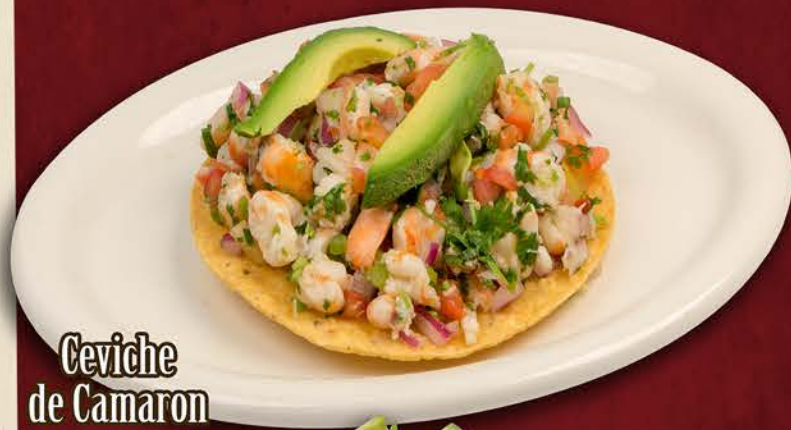
Ceviche de Camaron