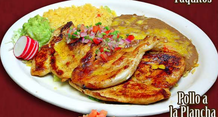
Pollo a la Plancha