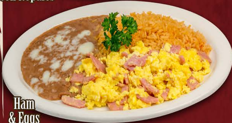
Ham & Eggs