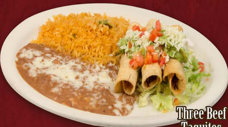
Three Beef Taquitos

NO SUBSTITUTIONS ANY SUBSTITUTIONS ADD EXTRA