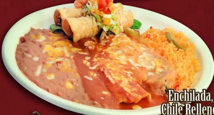
Enchilada, Chile Relleno y Taquito