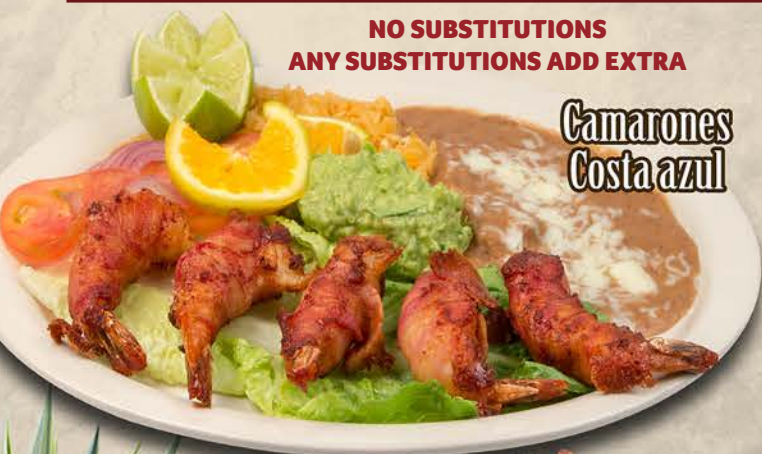
Camarones Costa azul

NO SUBSTITUTIONS ANY SUBSTITUTIONS ADD EXTRA