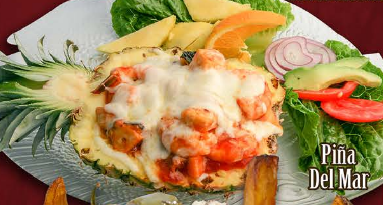
Piña Del Mar