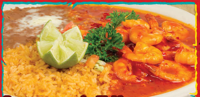
Camarones a la Diabla