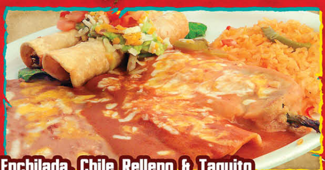
Enchilada, Chile Relleno & Taquito

NO SUBSTITUTIONS ANY SUBSTITUTIONS ADD EXTRA