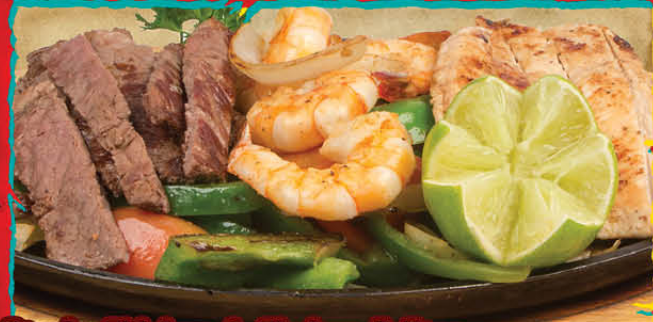
Steak, Chicken & Shrimp Fajitas