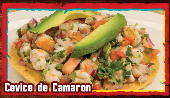
Ceviche de Camaron