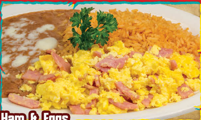
Ham & Eggs