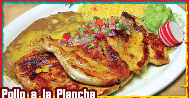
Pollo a la Plancha