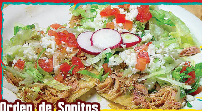
Orden de Sopitos