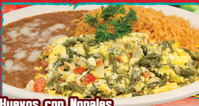
Huevos con Nopales