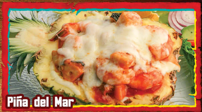
Piña del Mar