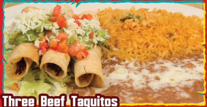
Three Beef Taquitos