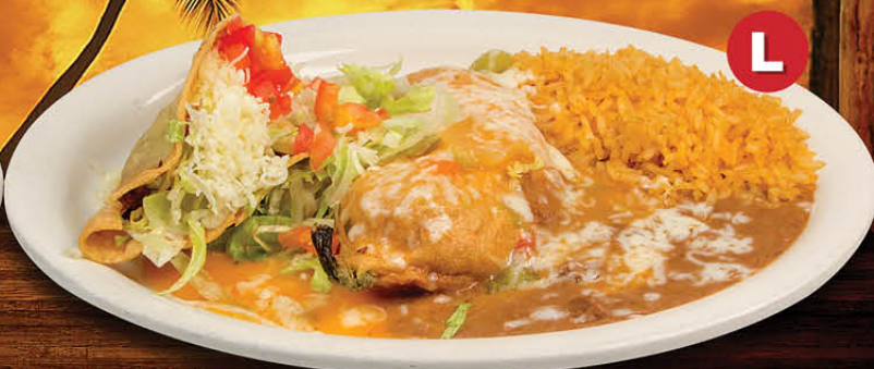
L CHICKEN TACO & CHILE RELLENO 14.25