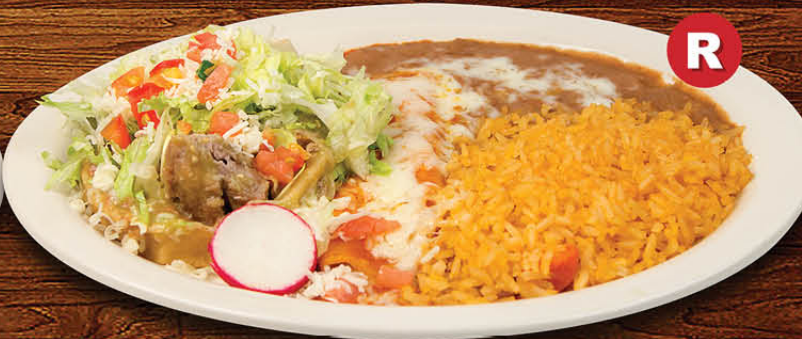
R CHILE VERDE SOPE & CHEESE ENCHILADA 14.00