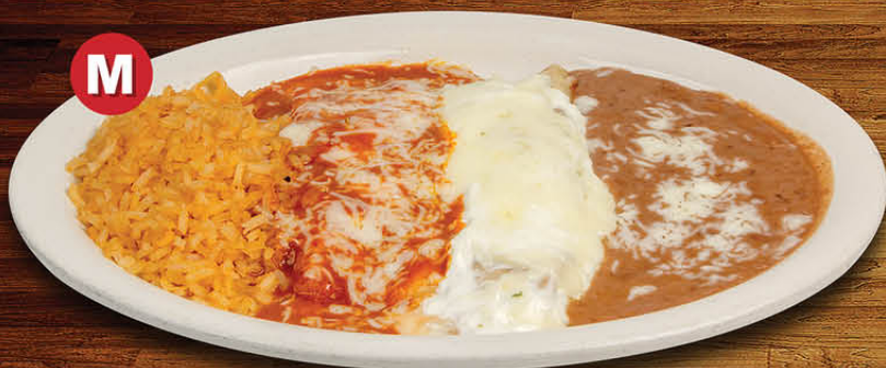
M CHEESE & SOUR CREAM ENCHILADA 14.00