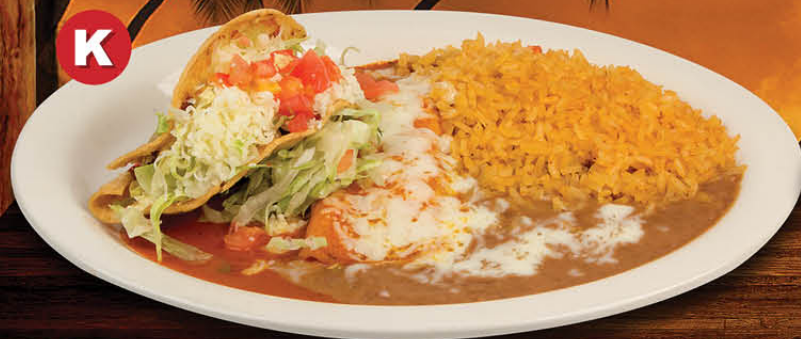
K BEEF TACO & CHEESE ENCHILADA 14.00

Es un placer para nosotros cocinar comida fresca y caliente recién hecha especialmente para usted. No substitutes.