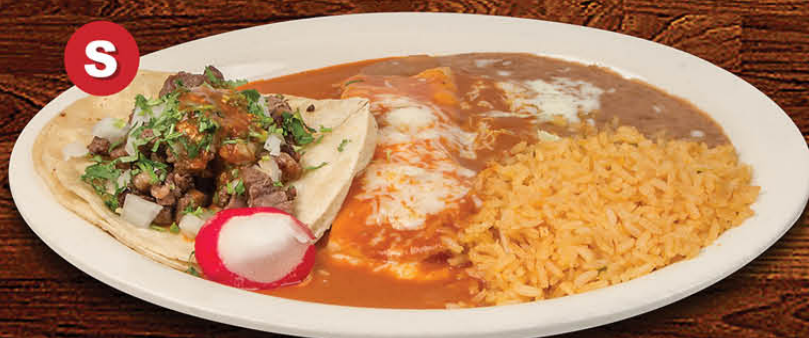
S CARNE ASADA TACO & CHEESE ENCHILADA 14.00