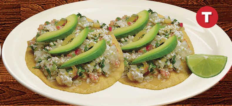
T 2 TOSTADAS DE CEVICHE DE PESCADO 14.00