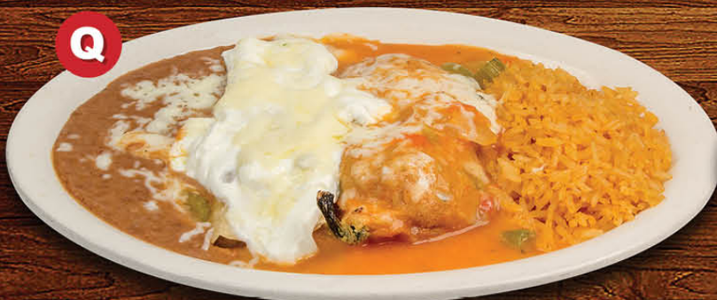
Q CHILE RELLENO & SOUR CREAM ENCHILADA 14.25