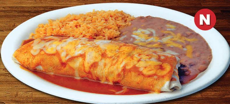
N OVEN BURRITO 14.00 Beef & beans burrito made enchilada style