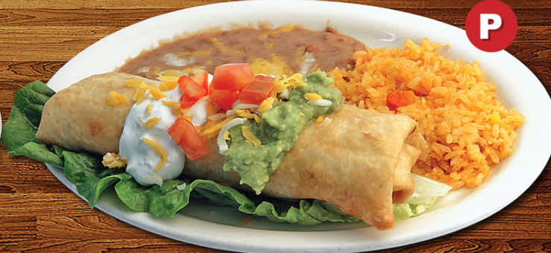
P FLAMINGO 14.25 Deep fried burrito made w/chicken & beans, topped with guacamole & sour cream