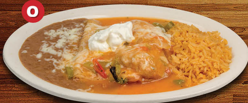
O ENCHILADA RANCHERA & CHILE RELLENO 14.25 Topped with sour cream