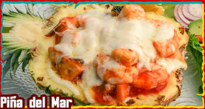
Piña del Mar

NO SUBSTITUTIONS ANY SUBSTITUTIONS ADD EXTRA