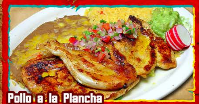
Pollo a la Plancha