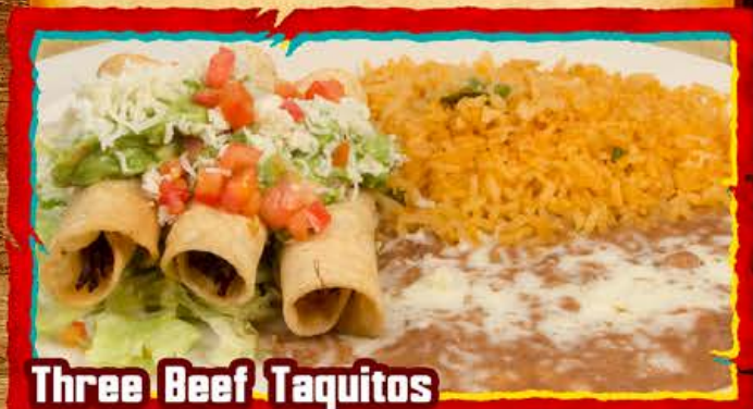
Three Beef Taquitos