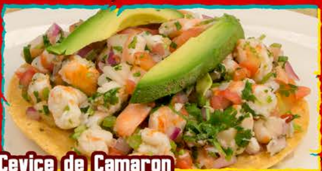
Ceviche de Camaron