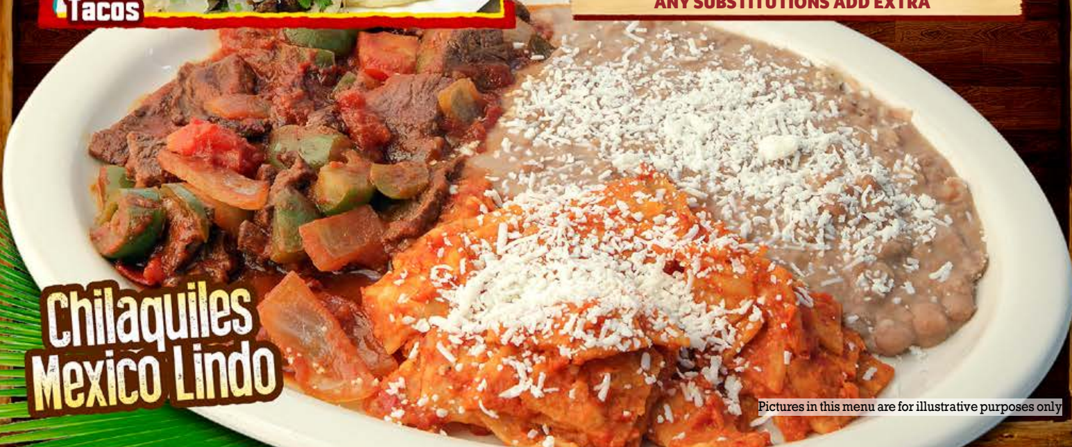
Chilaquiles Mexico Lindo

NO SUBSTITUTIONS ANY SUBSTITUTIONS ADD EXTRA