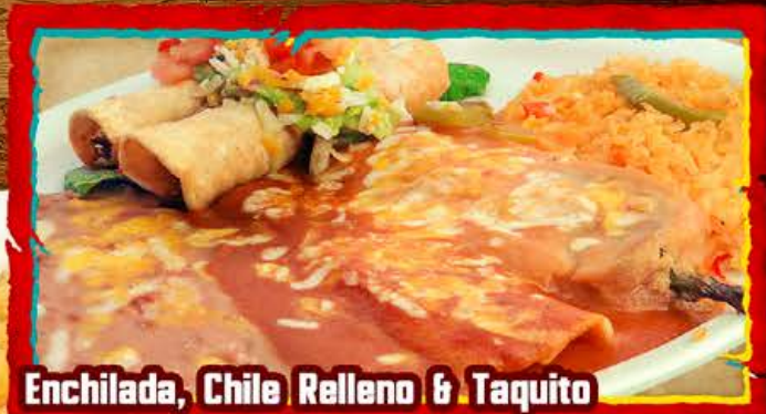
Enchilada, Chile Relleno & Taquito

NO SUBSTITUTIONS ANY SUBSTITUTIONS ADD EXTRA