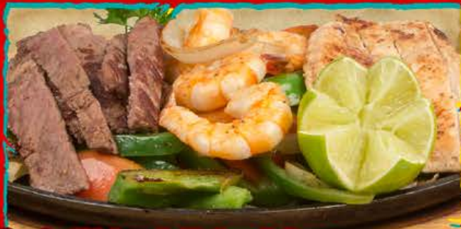
Steak, Chicken & Shrimp Fajitas