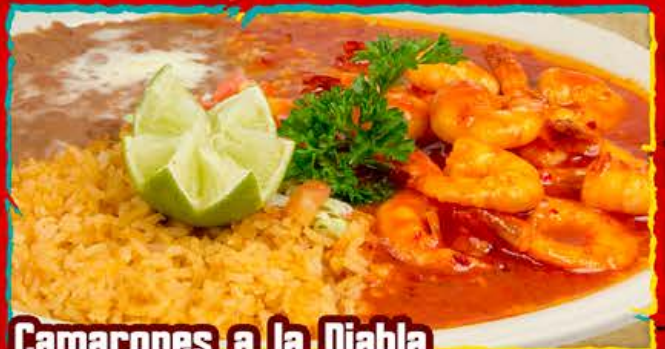
Camarones a la Diabla