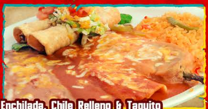
Enchilada, Chile Relleno & Taquito

NO SUBSTITUTIONS ANY SUBSTITUTIONS ADD EXTRA