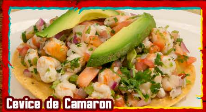
Ceviche de Camaron