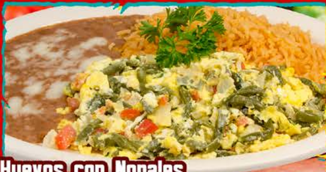
Huevos con Nopales