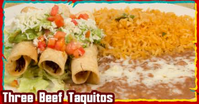
Three Beef Taquitos