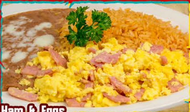
Ham & Eggs