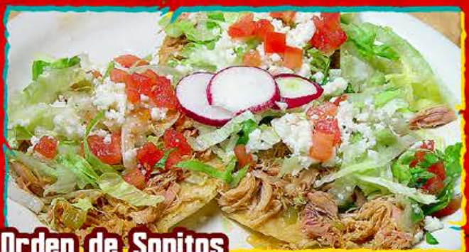
Orden de Sopitos