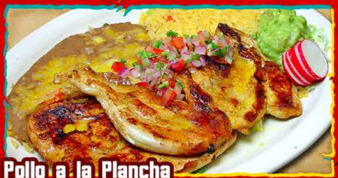
Pollo a la Plancha