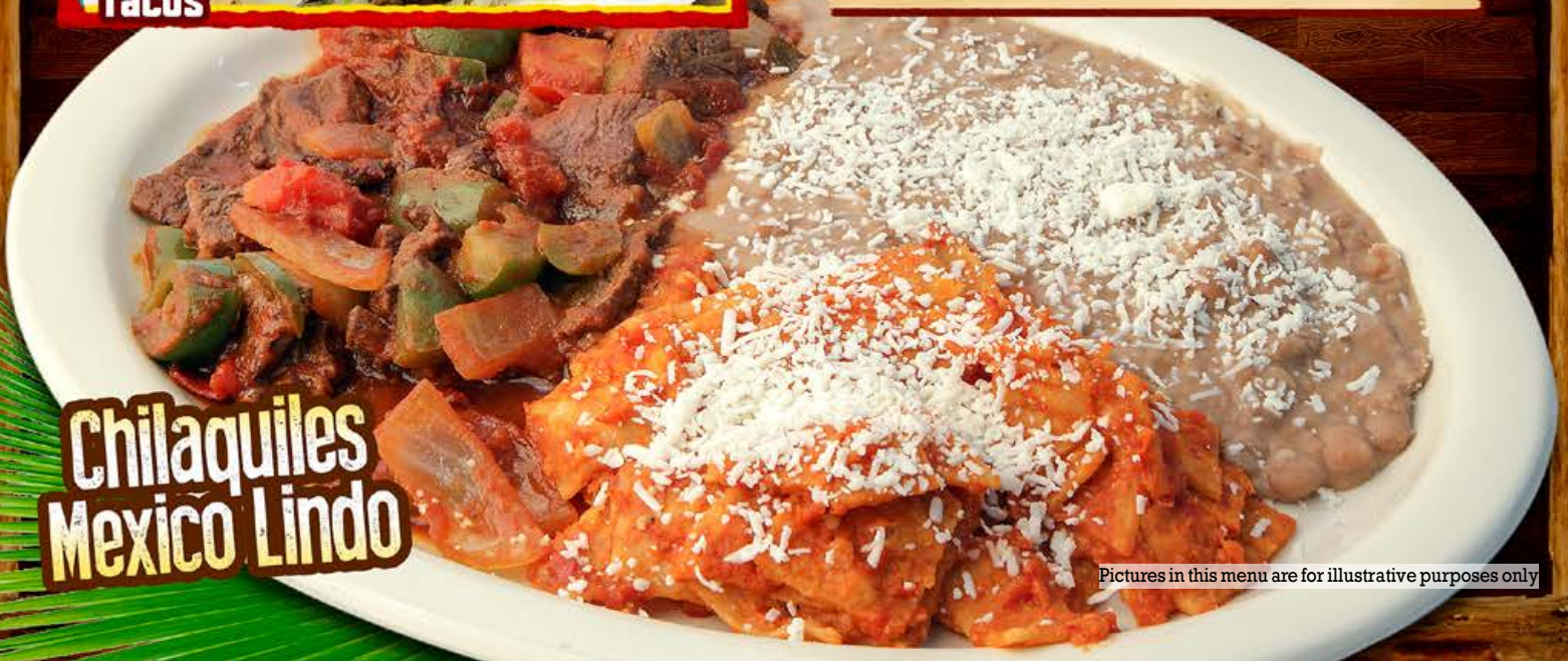
Chilaquiles Mexico Lindo

NO SUBSTITUTIONS ANY SUBSTITUTIONS ADD EXTRA