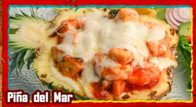
Piña del Mar

NO SUBSTITUTIONS ANY SUBSTITUTIONS ADD EXTRA