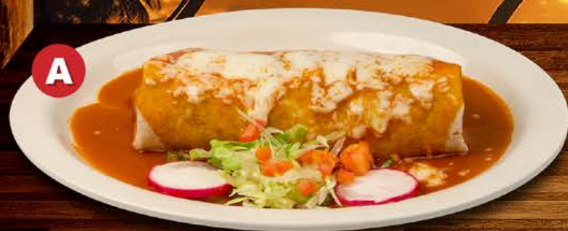
OVEN BURRITO 9.99 Shredded beef or chicken