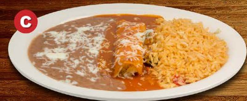
CHEESE ENCHILADA 9.99 Rice & beans