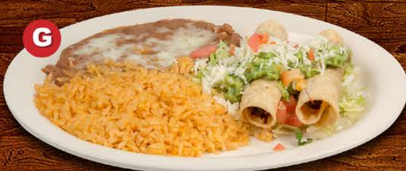
2 BEEF TAQUITOS 10.50 Rice & beans