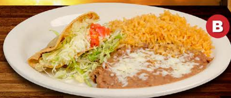
TACO 9.99 Shredded beef or chicken w/ rice & beans