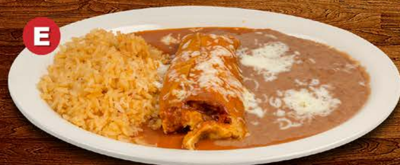
TAMAL 10.50 Rice & beans