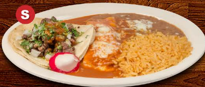
CHILE VERDE SOPE & CHEESE ENCHILADA 11.85