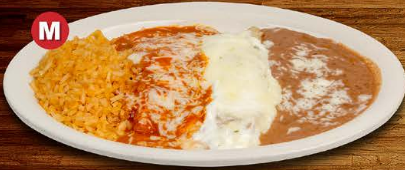
CHICKEN TACO & CHILE RELLENO 11.85