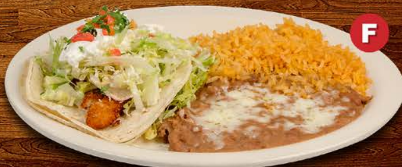
FISH TACO 10.50 Rice & beans