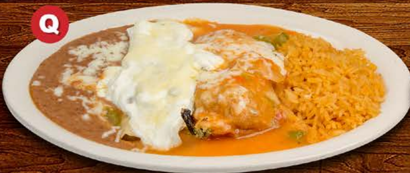
FLAMINGO 11.95 Deep fried burrito made w/chicken & beans, topped with guacamole & sour cream