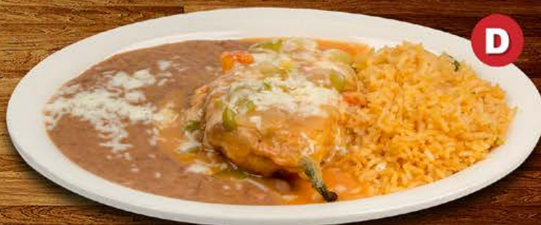
CHILE RELLENO 10.50 with rice & beans