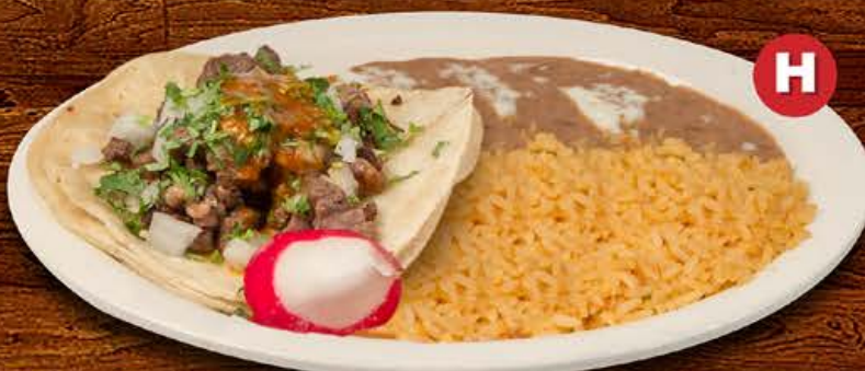
TACO DE ASADA 10.50 w/ rice & beans